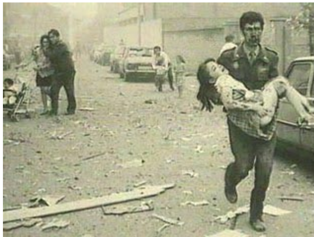
Images of a car bomb attack at a Guardia Civil barrack in Vic in 2001.

What happens if there is a criminal attack which causes a disaster and public authorities do not have take all the possible planning measures to avoid it? A second interesting Spanish judicial decision concerning public responsibility in the prevention of disasters (for the first, see above in 4.2. the disaster of the Biescas campsite) is the Spanish Supreme Court decision of November 2, 2004. In this case, the judges considered the car bomb attack against a barrack of the Spanish security forces (specifically, the Guardia Civil). The explosion caused one death.