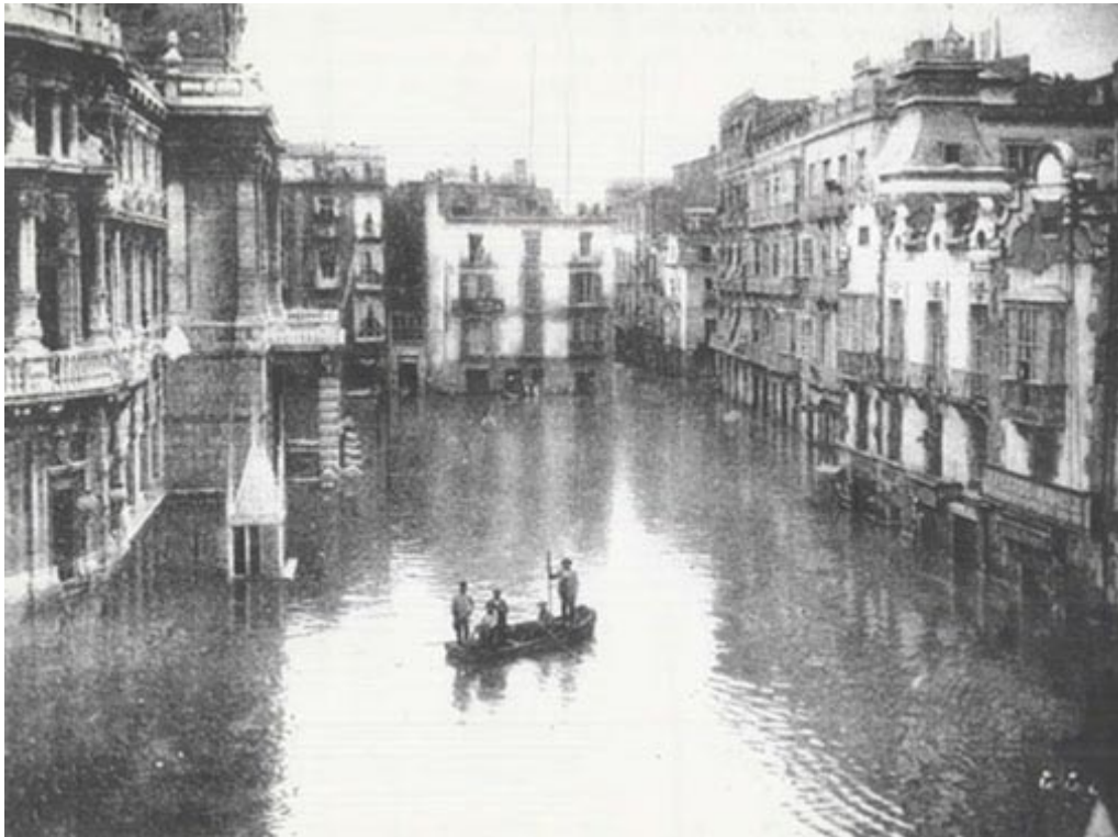
Cartagena (South East Spain). Town Hall square, 1919. 2 meters of water.

Parliament, European Council 2007) on the assessment and management of flood risks.