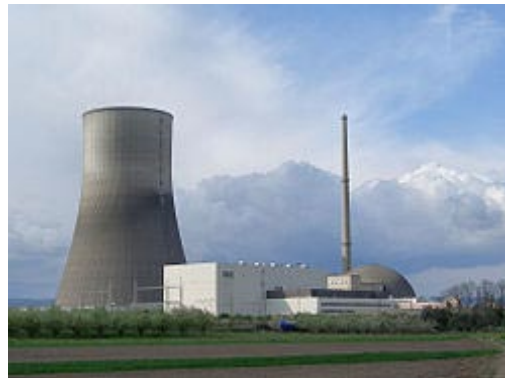
Mülheim-Kärlich Nuclear Power Plant.

In that decision, the German Constitutional Court emphasized the huge relevance of administrative procedures (as the moment for risk assessment). Administrative procedure is a tool to protect the right to life and physical integrity, not just a defensive tool, but an active tool to promote the respect for fundamental rights by imposing the duty of protecting and promoting them on public authorities.