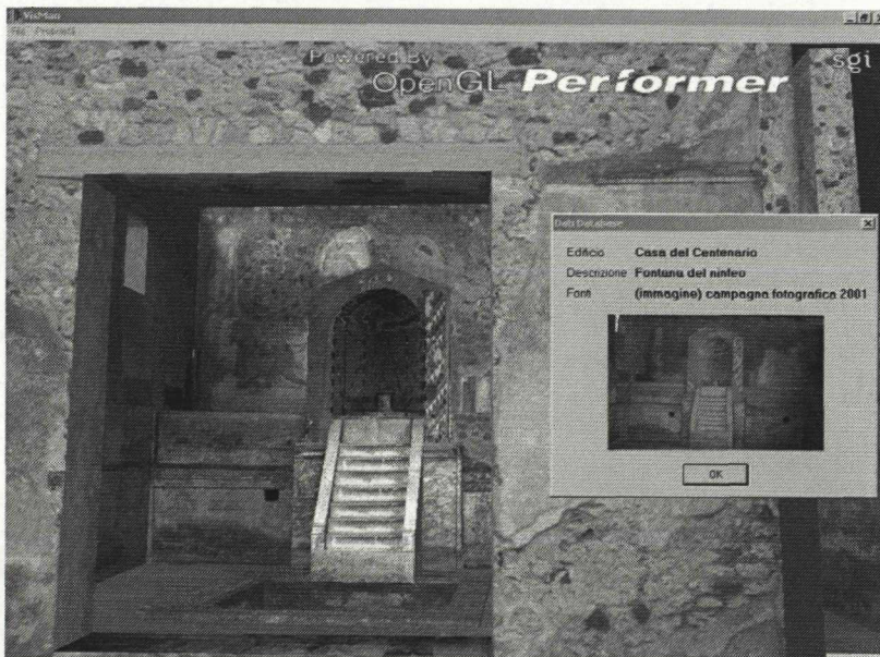
Figure 2 Some experimentations for linking the ninfeum of the reconstructed Casa del Centenario in Pompeii to a database

2 - with a desktop fruition, for both navigating the model and accessing the Data Base. Thanks to the collaboration with the VISMAN project (supported by the Spinner Consortium with Regione Emilia-Romagna and EU funds), 3D models are being linked to different relational Databases. Users, depending on the kind of DB chosen, can inquire GIS or multimedia sources. In this case, selecting objects in the scene, users obtain explanations on the selected object and see original photos. In other applications, as the one we are currently developing for the Certosa of Bologna, 3D models are a graphic interface for accessing the land register, GIS and the historical sources archived in a multimedia database with audio, video and texts about the partisans' sacrarium.