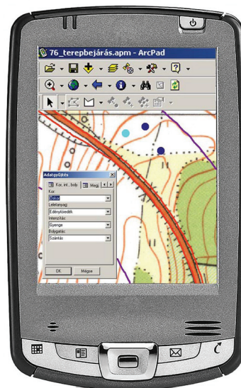
Fig. 2. The field survey device and database used in Zala County.

Recent development of IT devices opens up new vistas of field survey (Campana 2005; Tripcevic 2004). This resulted in important changes in detecting and documenting new sites. The field survey device and the database developed for topographic survey and recording geodetic position used in our institution gives great support. The required hardware is a PDA with a GPS recorder (either built in or handheld). In our field-work we currently use a HP iPAQ Pocket PC. The handheld GPS-receiver (Royal-Tek - Mini