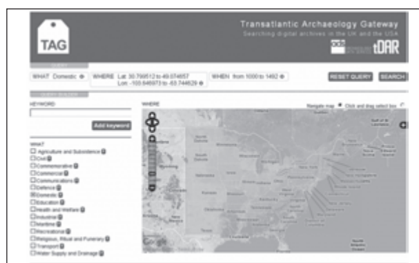
Figure 2. The map area selection module (Open Layers).

The 'What' facet of the query was probably the easiest element to create a user interface for. The simplest and most direct method was to use radio buttons to allow users to select one or more of the functional group search terms. These can also be removed from the query by means of a delete button (a green and white 'X') next to the selected term in the 'query section of the page'.