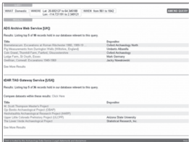
Figure 4. The query and results pages showing links to archive collections.

unlike the 'What' and 'When' elements of the query builder only a single instance of the facet can be selected for inclusion in the query. In essence this means that only a single bounding box can be selected at time. A very positive future enhancement of the system would be the ability for the user to select multiple bounding boxes. Similarly it would be helpful for more than one date range to be selected in a single search. The interface design changes required to do this, whilst not trivial, are far from insurmountable but it should be noted that it would also be necessary to change the TAG service specification to allow for multiple search terms and consequently the back-end searches implemented on the target repository systems would have to be updated.