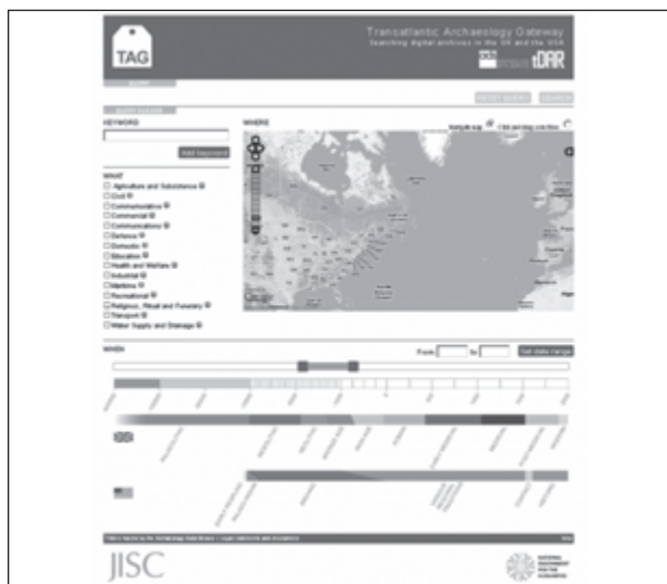
Figure 1. The TAG Portal Interface (TAG Search Interface 2011).

user in selecting a 'What, Where and When' are located. In addition to these facets, and because it is so key to almost all modern search paradigms, a keyword search box is included. The keyword is specified as a query variable in the TAG service specification and each service target decides which are the most appropriate metadata field(s) in their repository to index and search across using this search term.