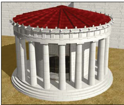
Fig. 5. Digital model of the tholos temple of Athena Pronaia from the South, Greg Schultz, Coastal Carolina University, 2007.

with other sources (monument-specific studies, and general surveys such as Dinsmoor 1973; Lawrence 1957), and carefully constructed digital wireframe models. For the tholos temple of Athena Pronaia ( Figs 1, 5 and 6 ), earlier measurements were compared with more recent studies (Bommelaer 1997; Ito 1997), and other elements, including the roof, lion-head waterspouts, triglyphs, mutules, guttae and acroteria were built and added to the structure. Textures taken from detailed onsite photographs of the extant marble blocks were applied to the outer surface. Students researched various contemporaneous roof types to determine whether Laconian, Corinthian or Sicilian tiling was most appropriate, and an alternate model with a two-tiered roof was built to address disparate scholarly opinions ( Figs 5 and 6 ).