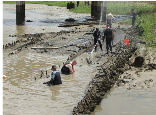
Figure 2. Clearing debris and sediment from the starboard side of the hull.

accumulated sediment and debris. Basic measured drawings were made of diagnostic features of the wreck. In addition, measurements of design and construction features were made to confirm subsequent laser mapping. Photographs were taken to record exposed sections of the hull. When recording and photography of the starboard side of the vessel was complete, the laser system was used to collect points identifying all exposed features.