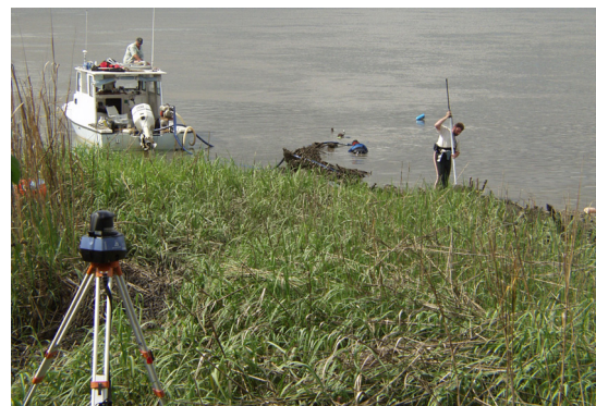
Figure 3. One of two laser transmitters mounted on tripods in the marsh.

The two laser transmitters were mounted on tripods in the marsh south of the wreck (see fig. 3). The system was calibrated using a combination of the datums and permanent references on the hull, such as well-secured bolts, spikes, and pins. Once calibrated, the laser was used to record a sufficient number of data points to define the three-dimensional characteristics of each feature. Working for a total of four days in between tides, the laser system was capable of recording thousands of three-dimensional data points. In the same amount of time, traditional methods would produce less than 10% of that number. As the tide ebbed, mapping proceeded aft and as it rose, mapping activity returned toward the bow.