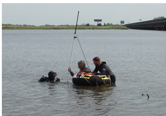
Figure 4. Mapping the stern.

After the quality of laser data was confirmed by processing, sections of the bilge ceiling were removed. Exposed floors, futtocks, and the upper seams of the hull planking were recorded using measured drawings and the laser system. Those floors and futtocks exposed at low tide were also photographed. Removal of the starboard ceiling permitted spaces between the frames to be cleared of sediment and the relationship of floors and half floors to the keel and keelson to be recorded.