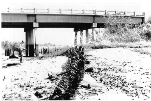
Figure 1. Recording exposed remains of the GA BR 17 derelict in 1991.