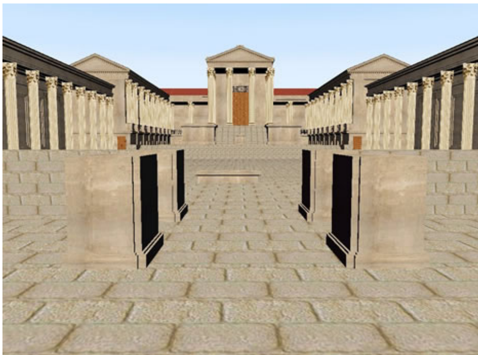
Figure 2 View (in greyscale) of the main entrance of the Virtual Flavian Forum of Conimbriga

This work can be seen in: http://lsm.dei.uc.pt/forum/ .