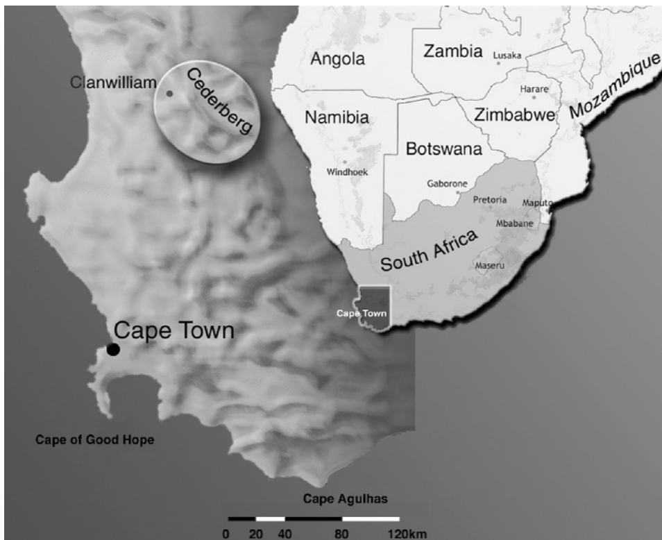
Figure 1 Southern Africa and the location of the Cederberg

The research project area covers 35 km 2 and is located about 5 km south of Clanwilliam stretching southward along the Olifantsriverdam and eastward into the tributary Rondegatvalley (Fig.2). To date, through a survey of the project area, we have identified and recorded 65 rock art sites, such as shelters, caves and painted boulders. Found within the Cape vegetation that consists mostly of drought-resisting sclerophyllous fynbos scrubs, these shelters and caves exhibit a great number of rock art paintings, mostly in the style of the fine-line tradition.