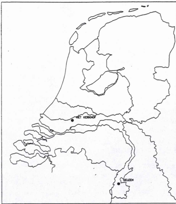
Figure 18.1: The Netherlands with the location of "Het Kerkhof" near Brandwijk and Geleen.

twenty days we recorded 4100 artefacts. In the electronic field book we registered X, Y and Z-co-ordinates (Fig. 18.2), find numbers, artefact categories and layer numbers. It was quite easy for one person to measure 500 artefacts a day. At the end of the working day we transferred the data from the SDR to dBASE, enabling us to add information for the description of the artefacts. The sort and plot options of our small program JAN11, a link between dBASE and AutoCAD, offer a thousand and one possibilities. This means that anything described in dBASE can be plotted.