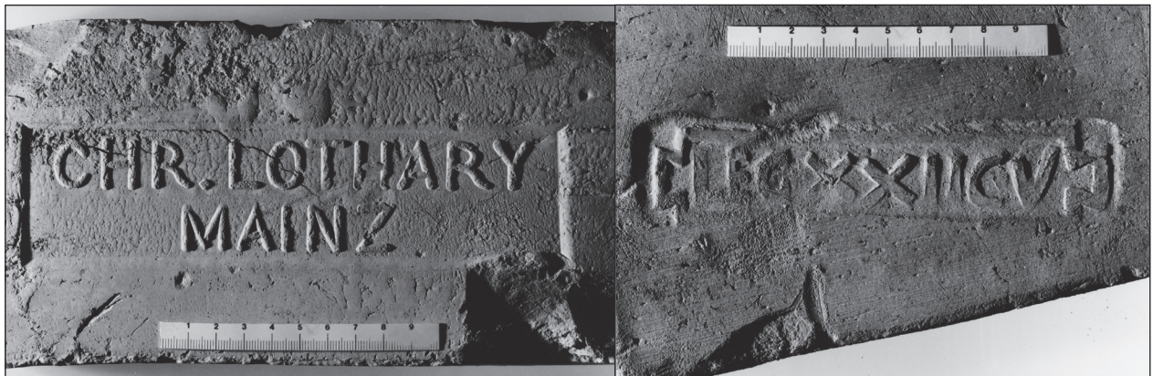
Fig. 4. (left) A brick from the Lothary brickyard from Mainz (19 th century). (right) A tile with a stamp of the legio XII that was recently found in Boppard (Rhine).

between two objects i and l . Here n_k is the number of objects in cluster C_k .