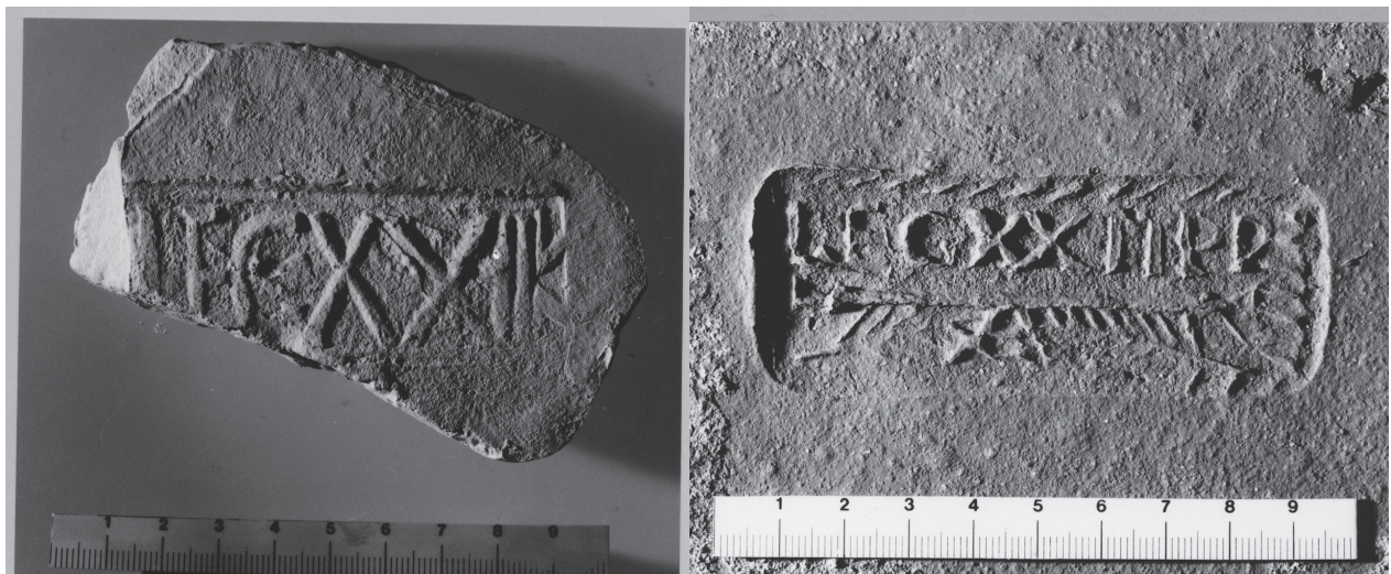
Fig. 1. (left) Staatliche Museen Berlin Preußischer Kulturbesitz (Antikensammlung) TC 5778a: later (brick) with stamp of legio XXII, findspot: Neuwied-Niederbieber, provenance: 'not yet known 1'. (right) Landesmuseum Mainz ZS 1581: tegula (tile) with stamp of legio XXII Primigenia Pia Fidelis, findspot: Mainz, provenance: Frankfurt-Nied.