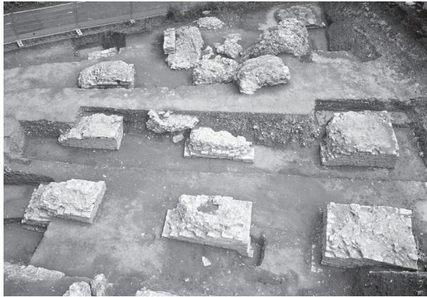
Fig. 3. Localization of the Roman theater in Mainz.

the i th object. Here the objects are archaeological findings. Further more, let C = \{x_1, \dots, x_l, \dots, x_l\} denote the finite set of the l objects. Alternatively written shortly as C = \{1, \dots, i, \dots, l\} .