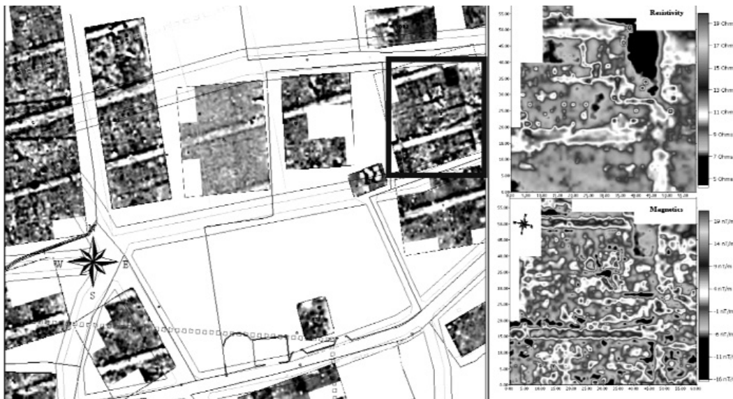
Figure 3 Details of the geophysical survey in ancient Lefkada. Comparison between soil resistivity (upper right) and vertical magnetic gradient (lower right) maps in grids X and Z

The area to the south of the SW-NE dirt-road, which divides the area of interest in north and south sections, exhibits a lower interest, as it is indicated by the decreasing density of geophysical features. The area of grids R1-R5 exhibits an elevation difference of about 3-4 m with respect to the dirt road and the north section of the surveyed region. In the projection of the dirt road to the west, large stone blocks may be correlated to the ancient city wall. Similar evidence exists along the dirt road reinforcing the hypothesis that at least a large section of the city wall is located along its length.