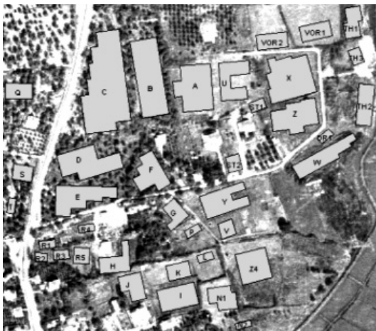
Figure 1 Layout and codification of the geophysical grids, as seen through their overlay on the aerial image of the site

According to the updated results of the archaeological excavations, the city seems to be divided in two parts: one on the hills of Koulmos to the west and one in the plain towards the coast to the east. The part that extends on the hills, where (possibly) ritual buildings and the remains of the ancient theatre have been found (Pliakou 1997, Pliakou 2001), has no specific urban planning, while the part at the plain was built according to an orthogonal system, very similar to the Hippodamian one. According to the information retrieved by different excavation trenches, the parallel streets, with average width 4.5 m (Agallopoulou 1971, Kalligas 1972, Andreou 1979), run across the city every 30 m in an E-W direction, that is from the hills to the sea. These streets intersect vertically with others of about 5.5-6 m in width (Andreou 1977, 1984), creating building plots with their long direction along the E-W axis. The study of the excavation results showed that two private houses, divided by a draining pipe, exist in every building plot (Douzougli 1993, Pliakou 1999). Other draining pipes run along the ancient streets (Agallopoulou 1971, Kalligas 1972, Andreou 1979). These pipes, being on the road surface just outside the houses, functioned as pavements.