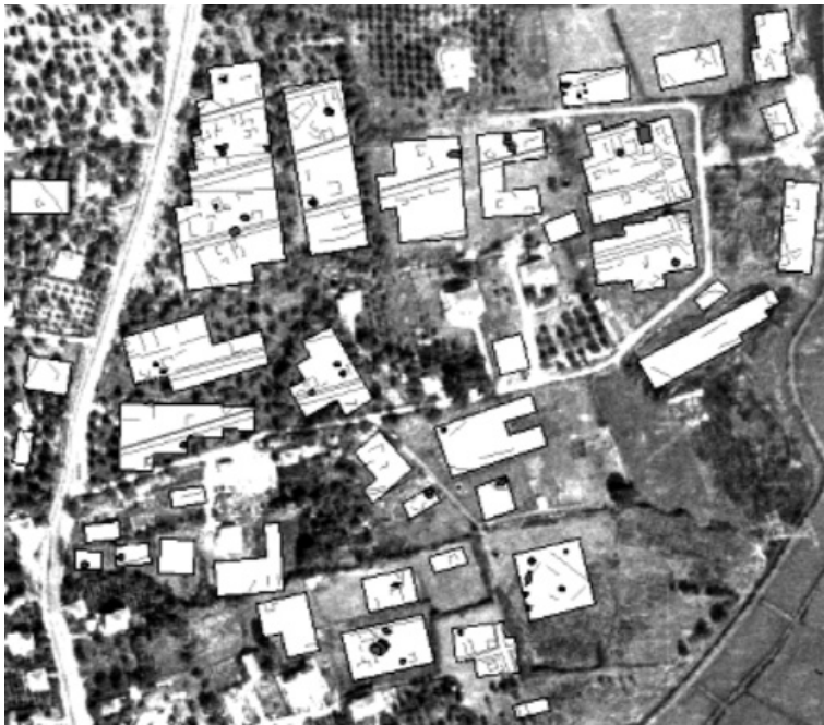
Figure 4 Diagrammatic representation of the magnetic and soil resistance anomalies

Ministry for the Environment, Physical Planning and Public Works (Hellenic Mapping and Cadastral Organization). These 1:6,000 scale photos, which were obtained at different dates (16/05/1985 and 12/10/1994), were scanned in high resolution, so as to achieve the optimum result in the quality of every image. These photos were also processed through histogram equalization and geometric registration in order to form a time sequence of aerial mosaics.