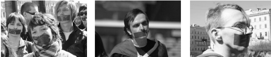
Figure 1. Silent fights against silence. 10

festivals for the 'insiders', street flash-mobs with mouths cross-bound. 9 It produces a subjectivity characterised by shame to herself. This subject prefers to stay private and accommodate.